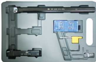
L459 Lathe Threading Tool Kit - Insert Type