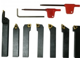
L0099 Lathe Turning Tool Kit - 7 piece Insert Type