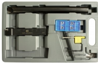
L459 Lathe Threading Tool Kit - Insert Type