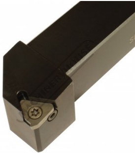
Toolholder Close Up