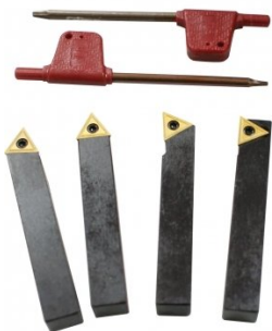
L0099 Lathe Turning Tool Kit - 7 piece Insert Type