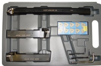
L453 Lathe Turning Tool Kit - 3 piece Insert Type