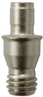
L5315 Seat Pin to Suit Turning Tool Holders