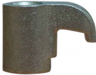
L535 Clamp to Suit Turning Tool Holders