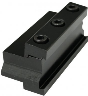
L029 Parting Block - Suits 26mm Blade