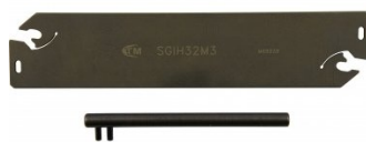
L4693 Parting Blade