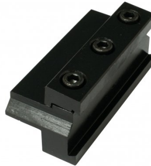
L027 Parting Block - Suits 26mm Blade