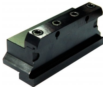
L029B Parting Block - Suits 32mm Blade