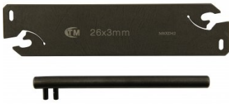
L469 Parting Blade