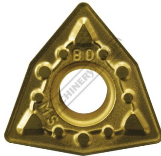
Tip Top View