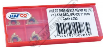
5 Piece Pack