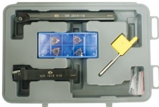
L458 Lathe Threading Tool Kit - Insert Type