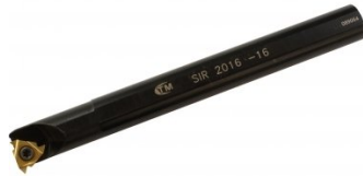
L037 Internal Threading