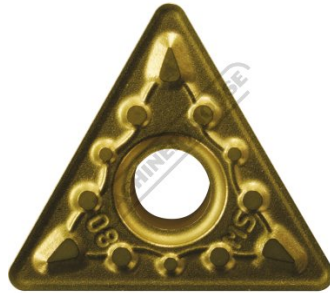
Tip Top View