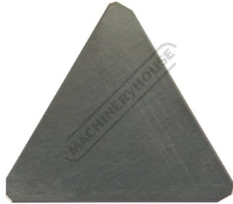
Tip Top View