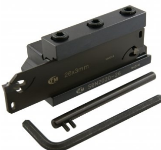
L467 Professional Lathe Parting Tool Kit - Insert Type