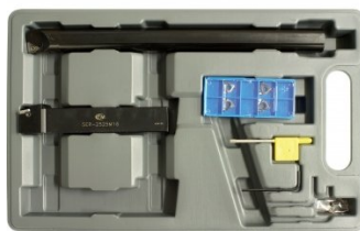
L464 Professional Lathe Parting Tool Kit - Insert Type