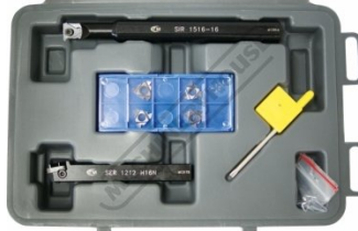
L457 Lathe Threading Tool Kit - Insert Type