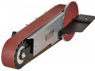
L0912 Industrial Belt & Disc Linishing Attachment