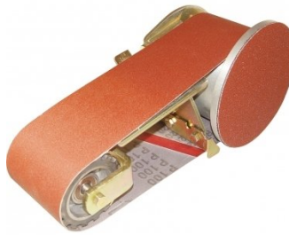
L087 Multitool Belt & Disc Linishing Attachment