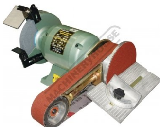
Shown Fitted to a Optional Bench Grinder