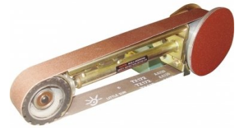
L088 Multitool Belt & Disc Linishing Attachment