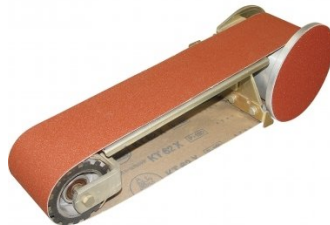
L090 Multitool Belt & Disc Linishing Attachment