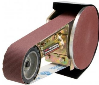
L085 Multitool Belt & Disc Linishing Attachment