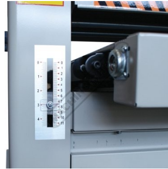
Table Height Gauge