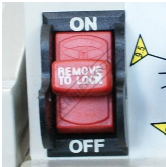
Safety Interlock Switch