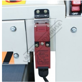
Lid Safety Interlock Switch