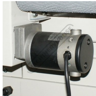
Table Feed Motor