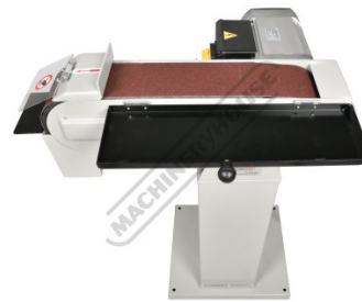
Side View With Lid Open