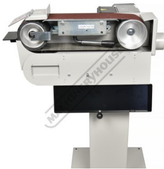
Quick Release Belt Replacement