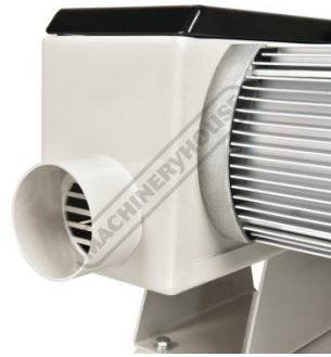
Rear Dust Chute