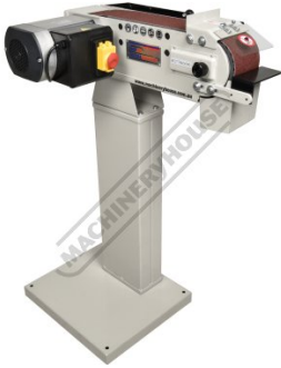
Shown With Top Lid Open