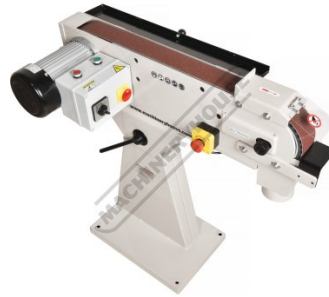
Large 75 x 465mm Woring Surface