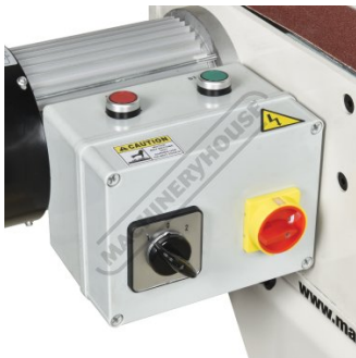
2 Speed Motor and On Off Switch