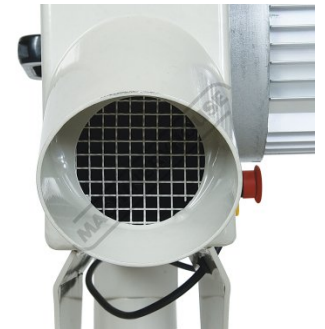
100mm Rear Dust Chute