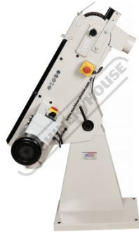
Head Tilting Up