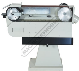
Side Open for Belt Replacment