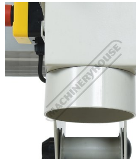
100mm Front Dust Chute