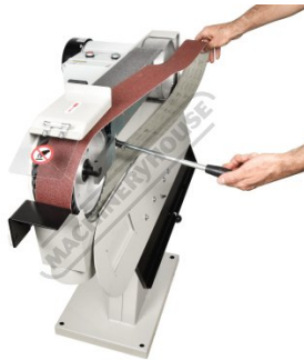
Quick Release Belt Replacment