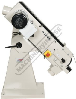
Head Tilting Down