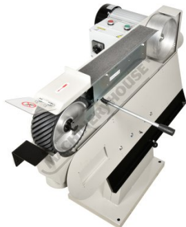
Platten Table has Graphite Wear Resistant Pad