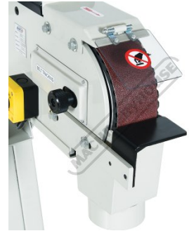
Safety Eye Shield Job Rest