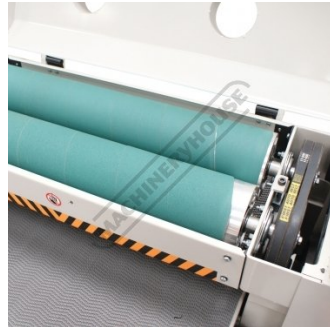
Twin Drum Sanding System