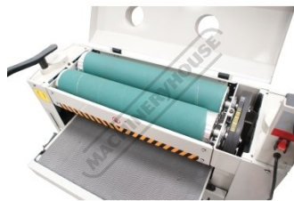
Top Guard Open