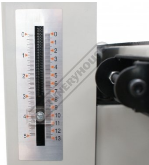
Thickness Height Gauge