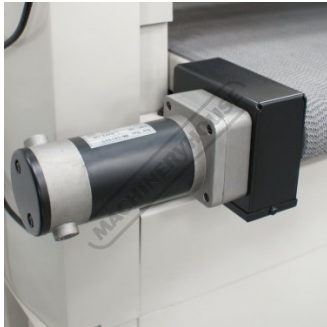
Conveyor Feed Motor