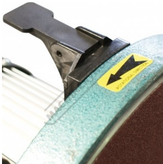
Mechanical Disc Brake