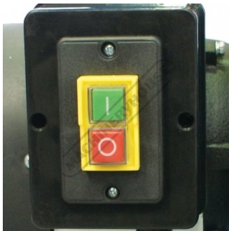
Start Stop Switch