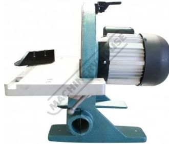
Rear Side View