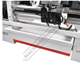
Slide Out Tray