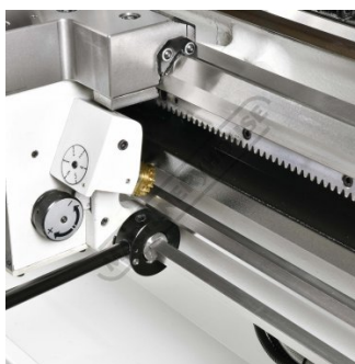
Thread Chasing Dial