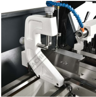
3 Point Travelling Steady