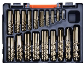
D126 Metric 135° Precision HSS Drill Set - 170 Pieces