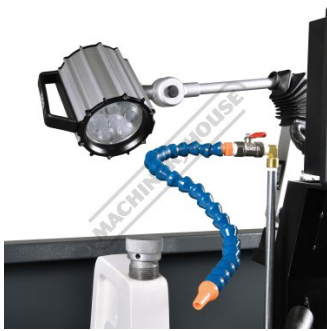
Adjustable Light Coolant Nozzle