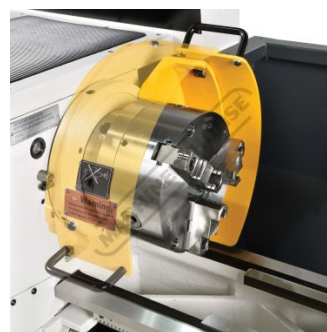
Chuck Guard with Safety Micro Switch