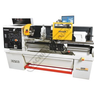
Optional Saddle Safety Guard