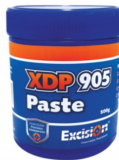
S074 Cutting Tool Lubricant Paste - 500g