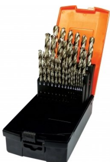
D1282 Imperial 135° Precision HSS Drill Set - 29 Piece