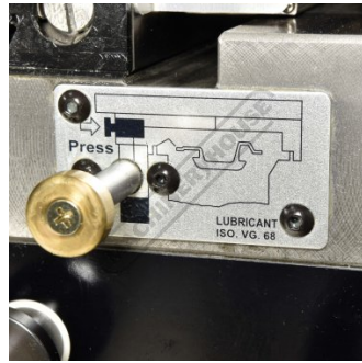
One Shot Lubrication