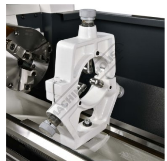
3 Point Fixed Steady