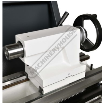
Heavy Duty Tailstock