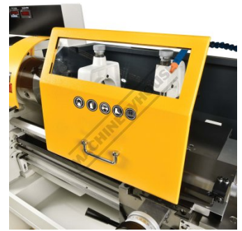
Optional Saddle Safety Guard