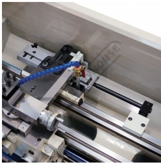
Shown Mounted to a Lathe