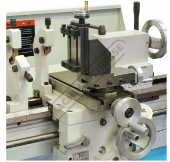
Shown fitted to Lathe