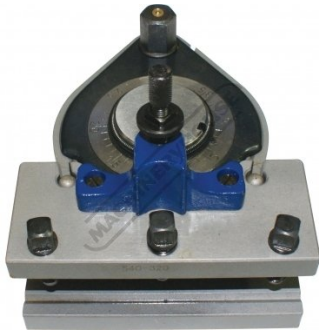
Quick Change Toolpost