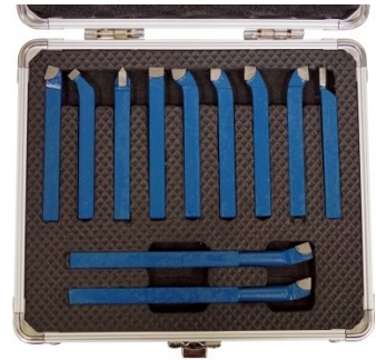
L0085 Carbide Turning Tool Set - 11 piece