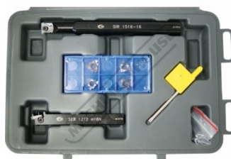
L457 Lathe Threading Tool Kit - Insert Type