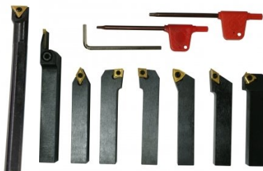
L0099 Lathe Turning Tool Kit - 7 piece Insert Type