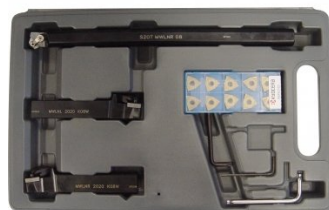
L452 Lathe Turning Tool Kit - 3 piece Insert Type