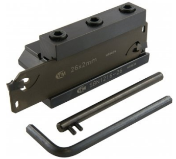
L464 Professional Lathe Parting Tool Kit - Insert Type