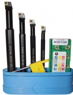
L072 HSS Turning Tool Set - 4 piece