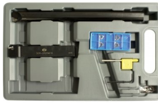
L459 Lathe Threading Tool Kit - Insert Type