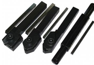
L0085 Carbide Turning Tool Set - 11 piece