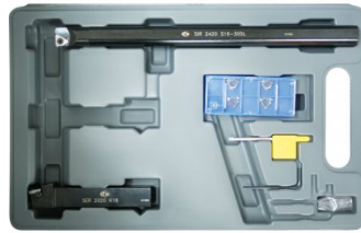
L458 Lathe Threading Tool Kit - Insert Type