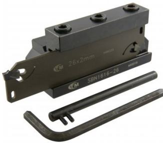
L465 Professional Lathe Parting Tool Kit - Insert Type