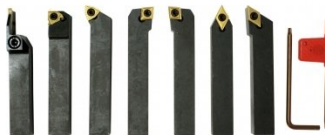
L0077 Lathe Turning Tool Kit - 7 piece Insert Type