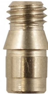
L503 Seat Pin to Suit Turning Tool Holders