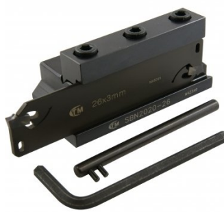
L467 Professional Lathe Parting Tool Kit - Insert Type