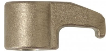
L504 Clamp to Suit Turning Tool Holders