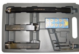
L453 Lathe Turning Tool Kit - 3 piece Insert Type