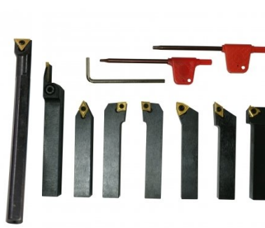
L0077 Lathe Turning Tool Kit - 7 piece Insert Type