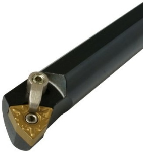
L415 Right Hand Boring Bar