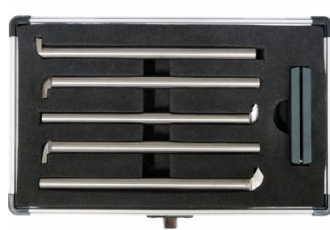
L006A Boring Bar Set - HSS