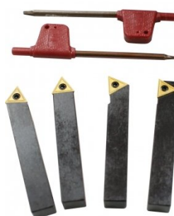
L0055 Lathe Turning Tool Kit - 5 piece Insert Type