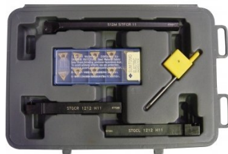
L450 Lathe Turning Tool Kit - 3 piece Insert Type