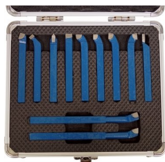
L0085 Carbide Turning Tool Set - 11 piece