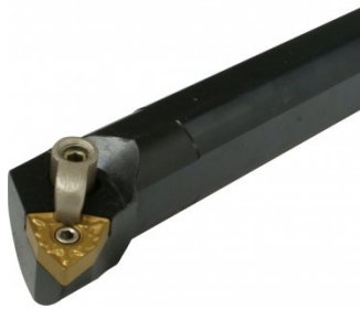
L416 Right Hand Boring Bar