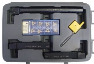
L451 Lathe Turning Tool Kit - 3 piece Insert Type