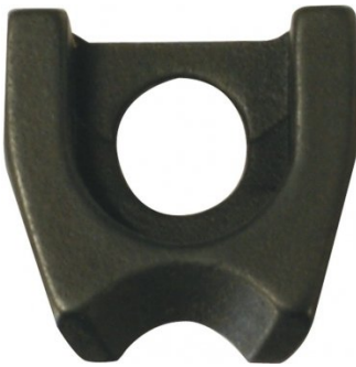
L515 Clamp to Suit Turning Tool Holders