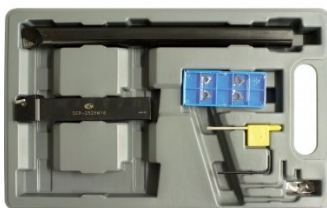
L459 Lathe Threading Tool Kit - Insert Type