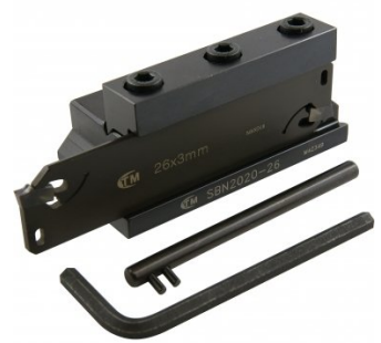
L466 Professional Lathe Parting Tool Kit - Insert Type