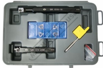
L456 Lathe Threading Tool Kit - Insert Type