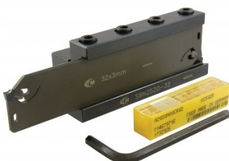
L467 Professional Lathe Parting Tool Kit - Insert Type