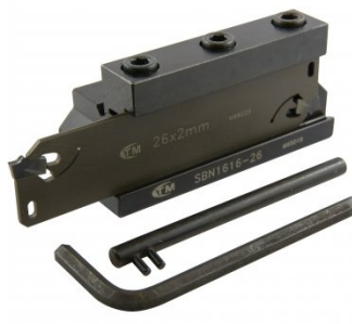
L465 Professional Lathe Parting Tool Kit - Insert Type