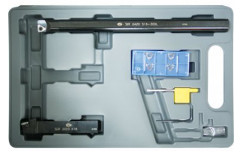
L458 Lathe Threading Tool Kit - Insert Type