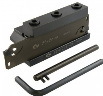
L464 Professional Lathe Parting Tool Kit - Insert Type