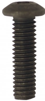
L516 Clamp Screw to Suit Turning Tool Holders