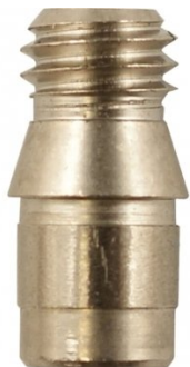
L503 Seat Pin to Suit Turning Tool Holders