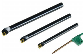
L430 Boring Bar Set - Carbide Insert