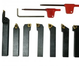
L0099 Lathe Turning Tool Kit - 7 piece Insert Type