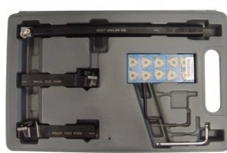
L452 Lathe Turning Tool Kit - 3 piece Insert Type