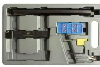
L450 Lathe Turning Tool Kit - 3 piece Insert Type