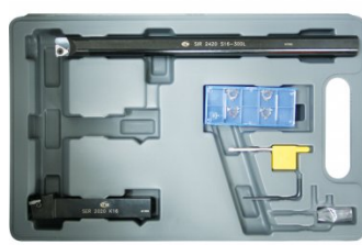
L458 Lathe Threading Tool Kit - Insert Type