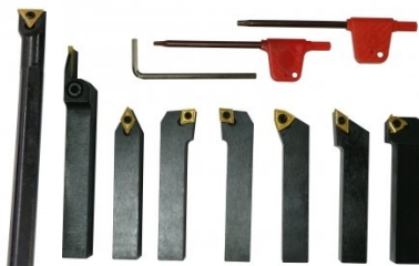
L0077 Lathe Turning Tool Kit - 7 piece Insert Type