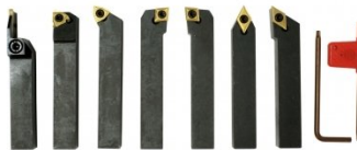
L0077 Lathe Turning Tool Kit - 7 piece Insert Type