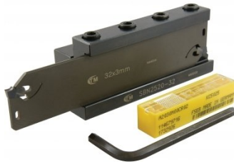
L467 Professional Lathe Parting Tool Kit - Insert Type