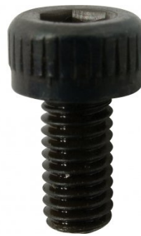
L540 Screw Seat to Suit Threading Tool Holders