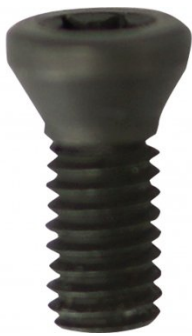
L539A Screw to Suit Threading Tool Holders