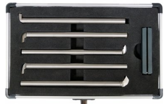
L006A Boring Bar Set - HSS