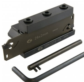
L464 Professional Lathe Parting Tool Kit - Insert Type