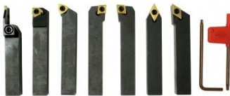
L0077 Lathe Turning Tool Kit - 7 piece Insert Type