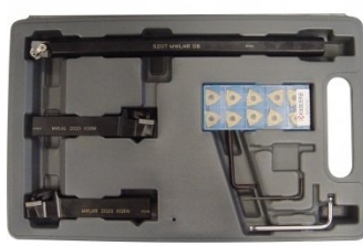
L452 Lathe Turning Tool Kit - 3 piece Insert Type