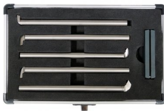
L006A Boring Bar Set - HSS