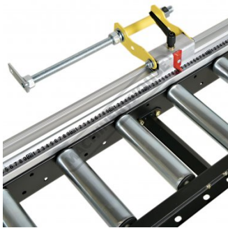
Shown In Open Position