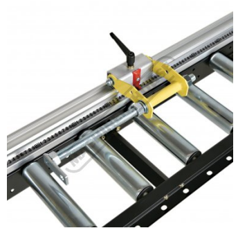
Shown In Stop Position