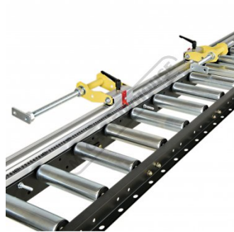
Shown With Optional Length Stop