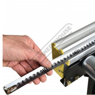
Measuring Scale Insert