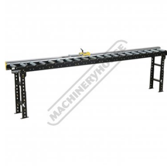
Shown With Optional Roller Conveyor