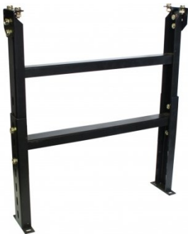
W343 Roller Stand