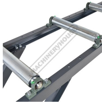
Additional Drill Holes For Extra Rollers