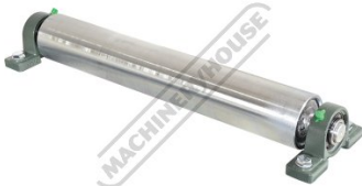
450mm Heavy Duty Ball Bearing Rollers with Grease Nipples