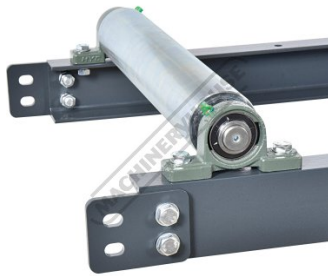
Extendable Attachment Plates