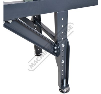
Adjustable Legs and Feet