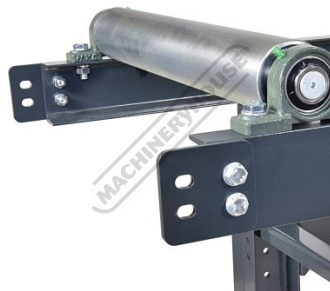
Extendable Attachment Plates