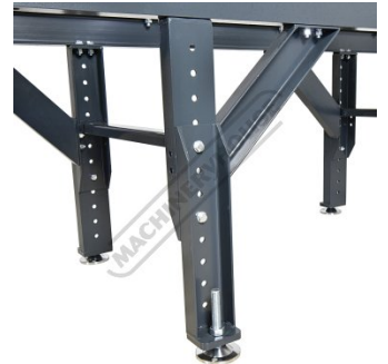
Adjustable Legs and Feet