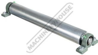
600mm Heavy Duty Ball Bearing Rollers with Grease Nipples