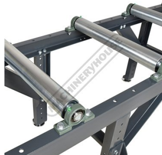
Pre drilled Holes for Extra Rollers