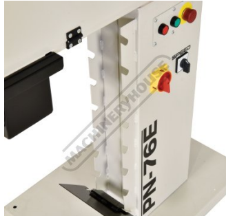
Rack For Roller Storage