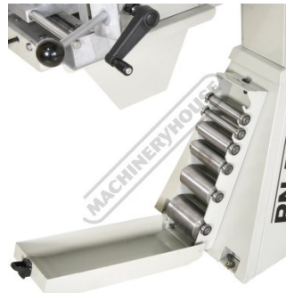
Covered Storage Rack For Rollers