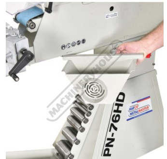
Removable Dust Tray