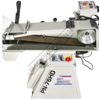
Belt Replacement Access