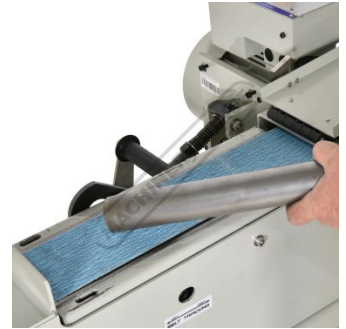
Top Station for Flat Lishing and Deburring