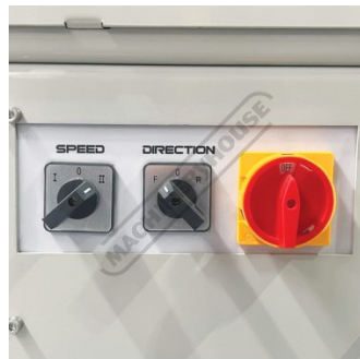
Control Panel Speed Direction