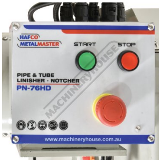
Top Control Panel