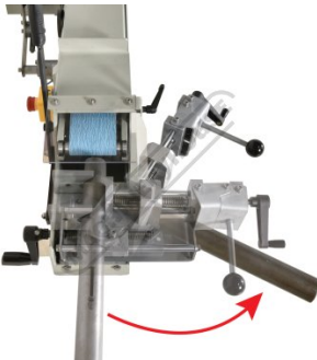
30 90 Degree Swivel Vice Jaws