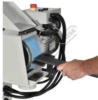
End Station Shown Lishing Flat Bar