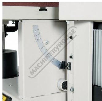
Tilting Table Scale