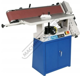
Tilting Sanding Belt 90-180 Degrees