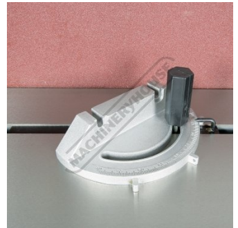
Mitre Guide Scale