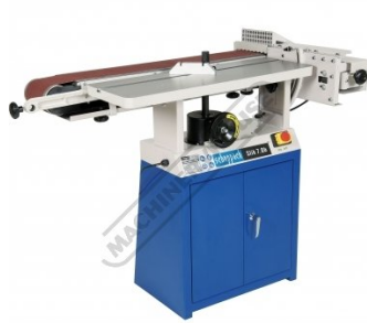
Horizontal Sanding Belt Position