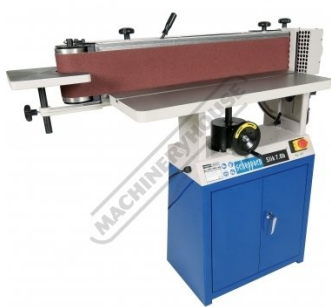
Table Height Lowest Position