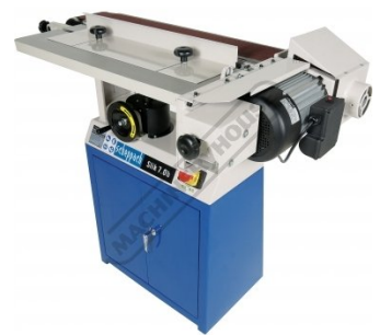
Table Guide Support Rear View