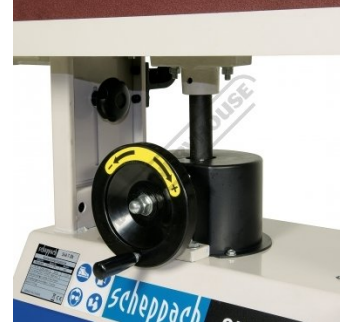
Table Height Adjustment Handle