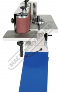
End Table View