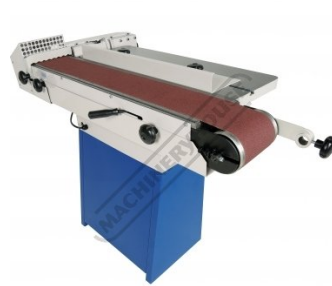
Table Guide Support