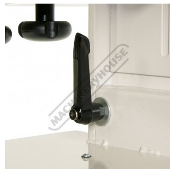
Belt Angle Tilt Lever Lock