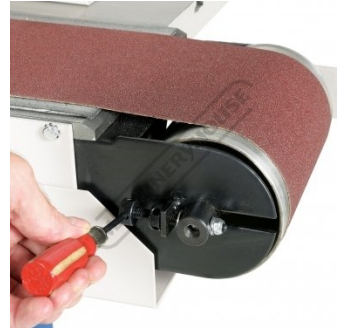
Belt Tracking Adjustment