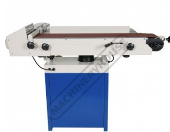
Side View of Belt