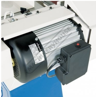
3hp Motor with Thermal Overload