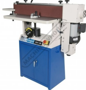
Right Rear View