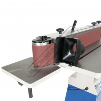
Dust Port for End Table