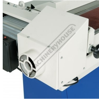
Rear Dust Extraction Port