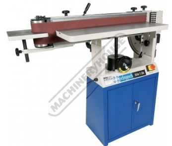
Adjustable Table Height