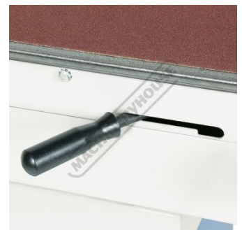
Quick Action Belt Tension Lever