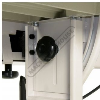
Table Height Locking Knob