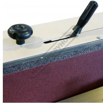
Belt Tensioning Handle