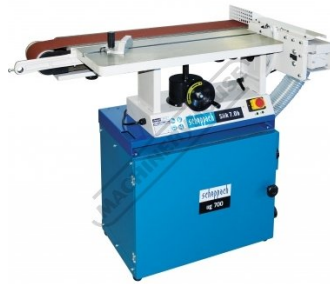
Horizontal Head Position