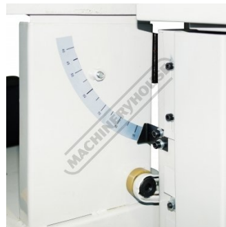
Head Angle Scale