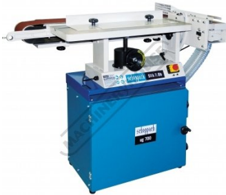
Table Guide Support