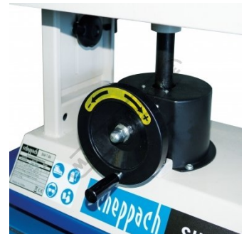
Table Height Adjustment Handle