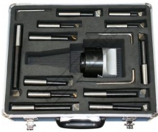
Top View in Case