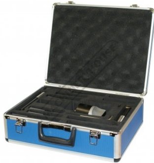
Case Shown Open