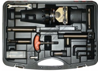
Shown in Case