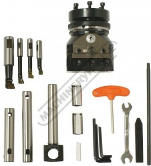
Set shown out of Case