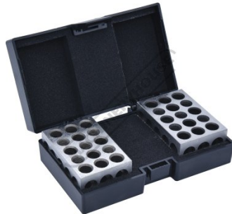
Shown in Case