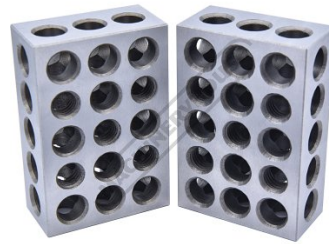
Set View 1