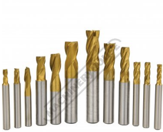
End Mill & Slot Drill Set