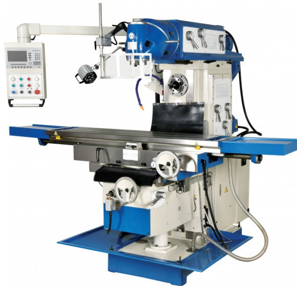
Table Travel: (X) - 1310mm (Y) - 300mm (Z) - 410mm Includes Digital Readout System & Servo Controlled X, Y & Z-Axis Feed System