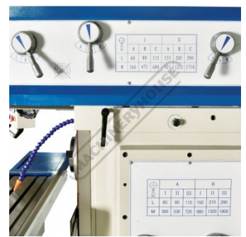
Top Gear Adjustment and Chart