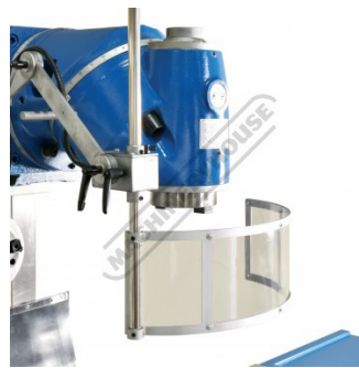
Safety Milling Guard