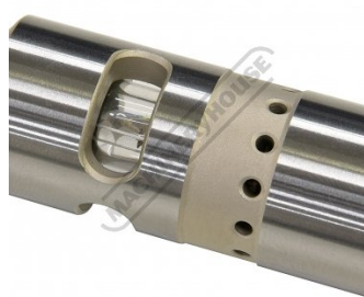
Red Light Illuminates & Audio Beep Sound Alerts for Deeper Holes