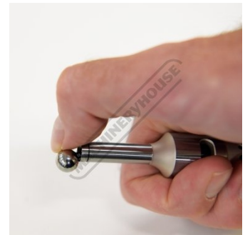
Spring Loaded Ø10mm Ball Shown