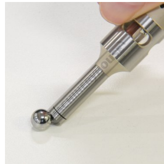
Spring Loaded Ø10mm Ball