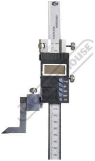
Display & Controls