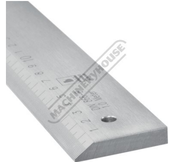
End Profile View