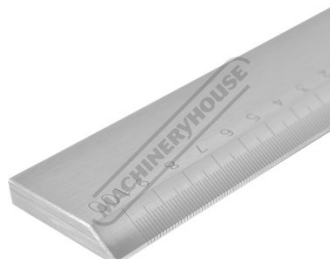
1000mm End View