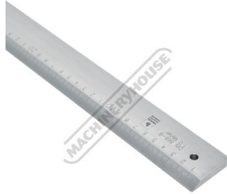
Clear Graduations Front Side