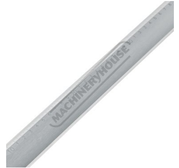
Clear Graduations Close Up 2