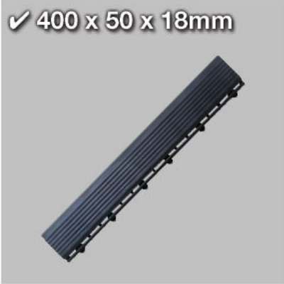
✓ 400 x 50 x 18mm