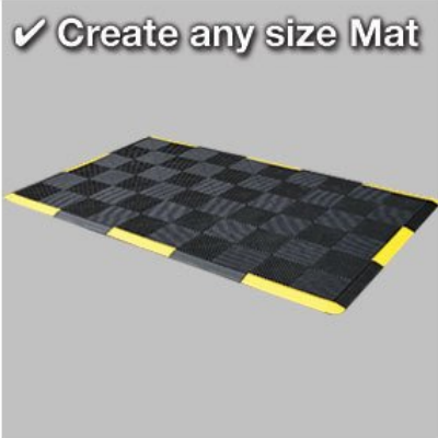
✓ Create any size Mat