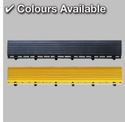
✓ Colours Available