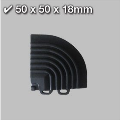
✓ 50 x 50 x 18mm