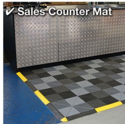
✓ Sales Counter Mat