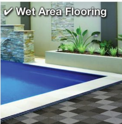
✓ Wet Area Flooring