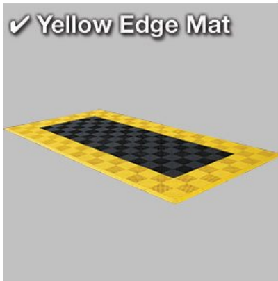
✓ Yellow Edge Mat