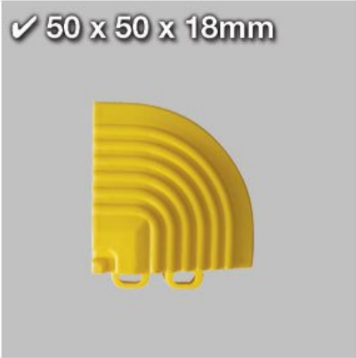
✓ 50 x 50 x 18mm