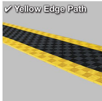
✓ Yellow Edge Path