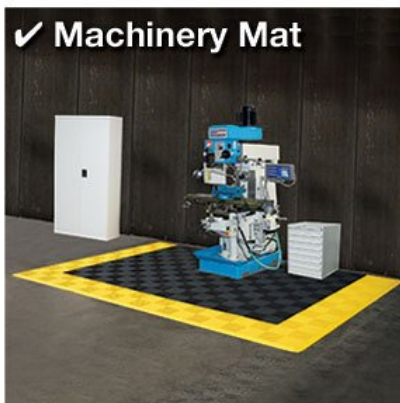
✓ Machinery Mat