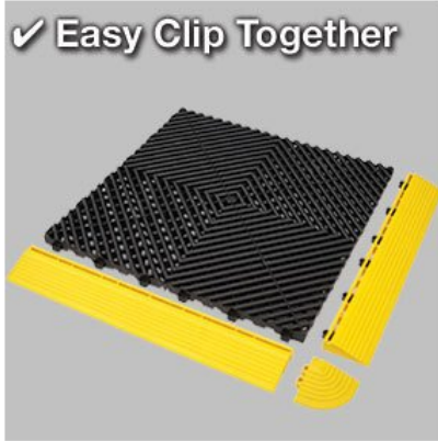
✓ Easy Clip Together