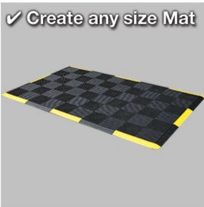
✓ Create any size Mat