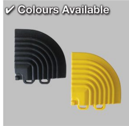
✓ Colours Available