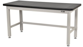
A420 Industrial Work Bench