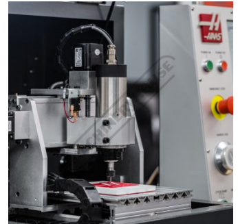
CNC Pen Holder