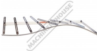
Shown with Concave & Convex Curves