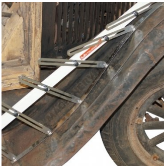
Truck Panel Close Up