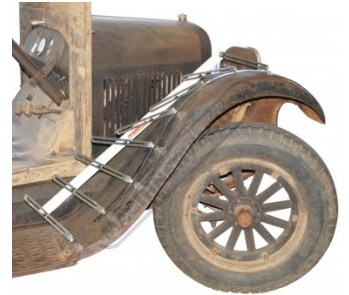
Shown On Truck Fender with 2 Curves