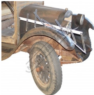
Shown On Truck Single Curve